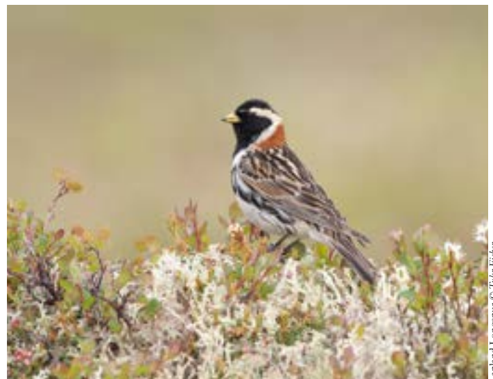
Lapland Longspur