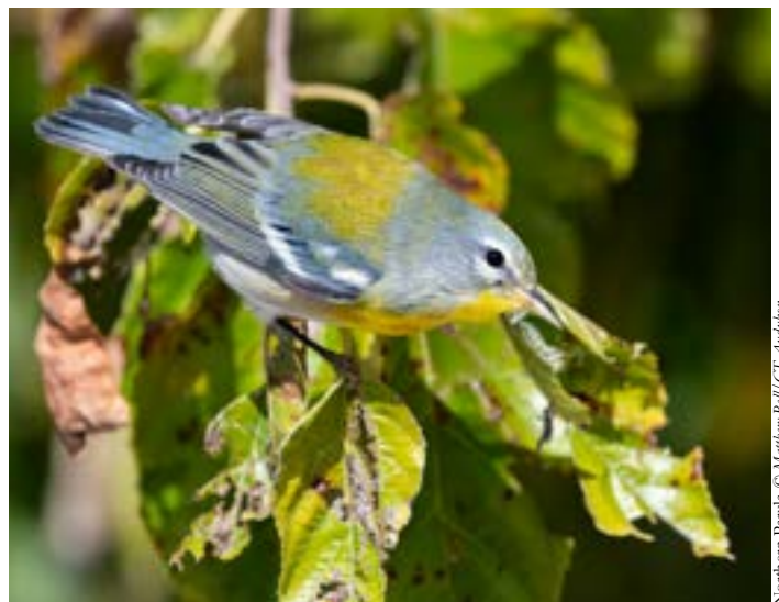
Northern Parula