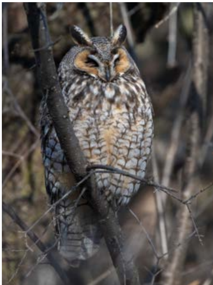
Long-eared Owl