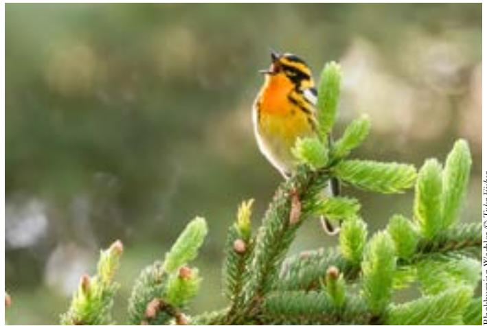
Blackburnian Warbler