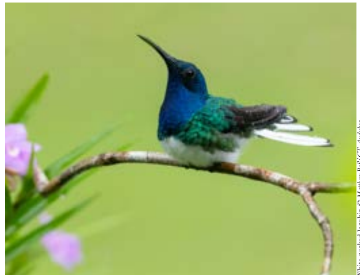
White-necked Jacobin

Our most popular cruise explores some of the most untouched rainforest in all of Amazonia. On an eight-cabin expedition vessel, travelers venture far up some of the least inhabited in the Amazon Basin for a full seven days and explore areas rarely visited, seeking out the mysterious life in the heart of the Amazon. This is the most thorough, detailed, and sophisticated trip offered in the entire Amazon and comes with rave reviews from past participants. Guides are accomplished local naturalists. This is easy for seniors and families! Starts at $3,800 per person. Extensions available. Call or email us for more information and a detailed itinerary.