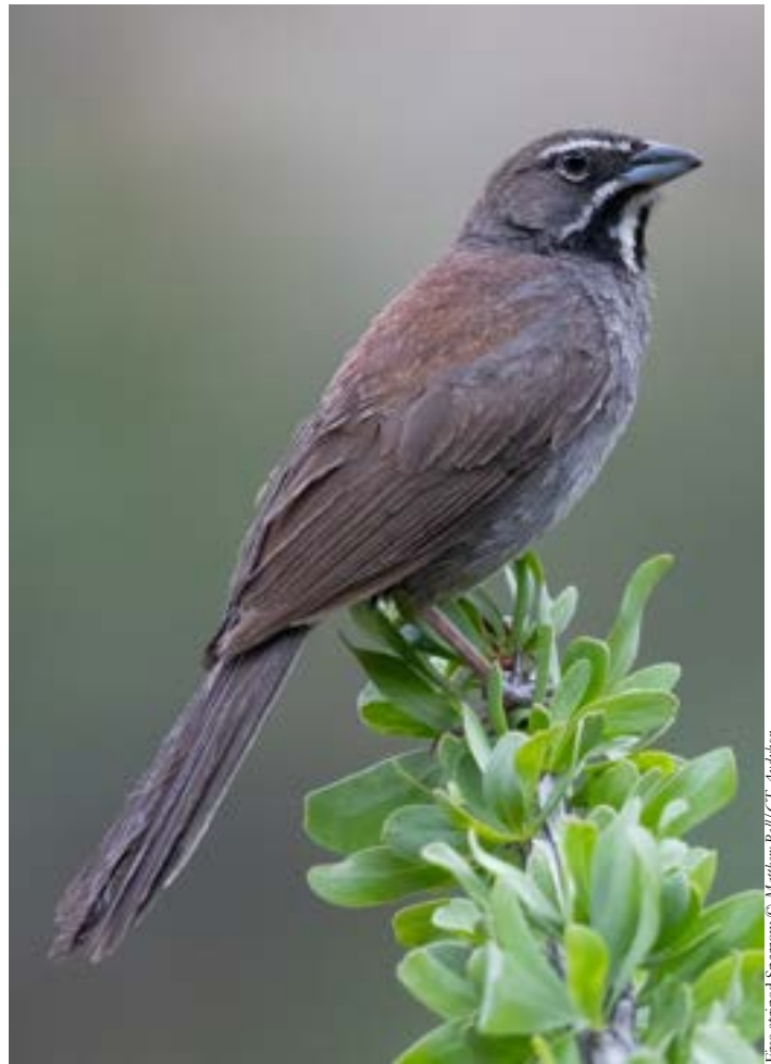
Five-striped Sparrow