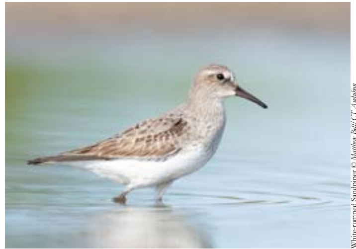
White-rumped Sandpiper