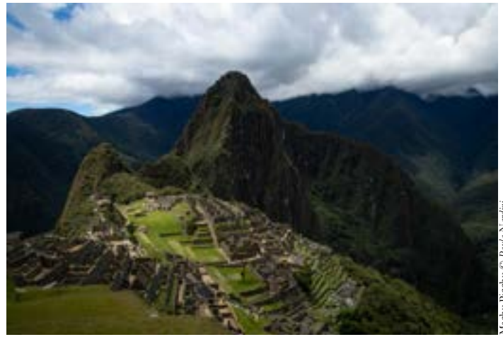
Machu Picchu

Dominated by a Mediterranean climate, Andalusia is the most biodiverse region in Spain and helps to make Spain the most biodiverse country in all of Europe. In 2027, a total solar eclipse will pass directly over the region, creating a spectacular backdrop. While the eclipse will be the main