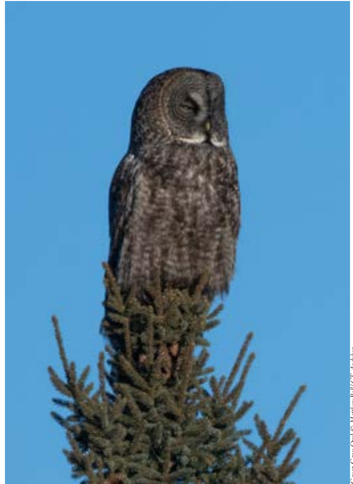
Great Gray Owl