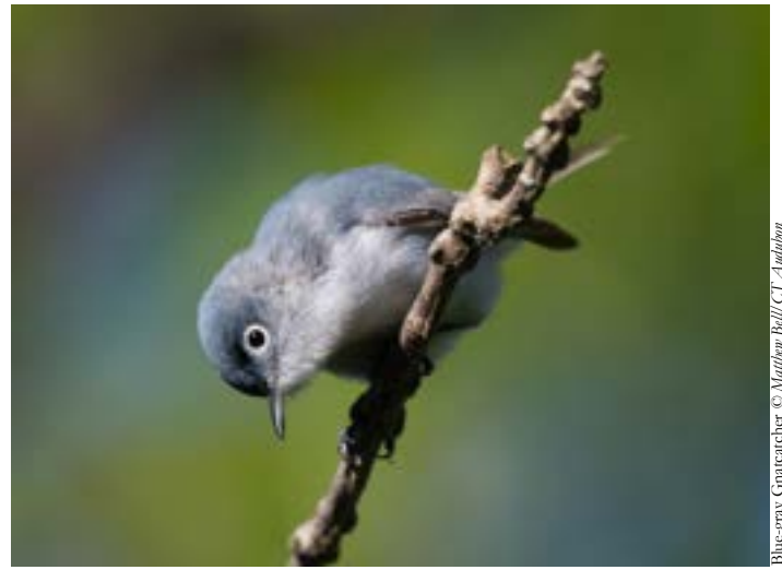
Blue-gray Gnatcatcher