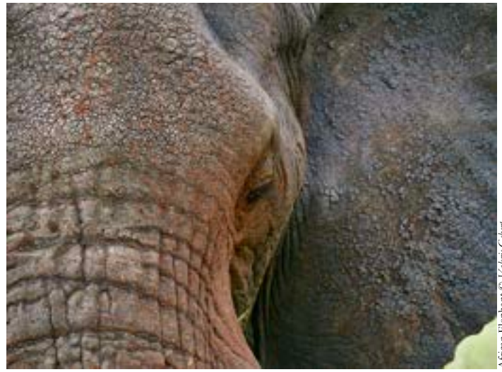
African Elephant