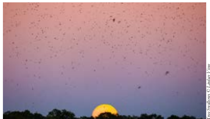
Tree Swallows

Witness one of the most spectacular avian events when thousands of Tree Swallows congregate on the lower Connecticut River at sunset to settle in on a giant communal roost during their fall migration. Birds come from miles away, creating a ballet of synchronized flight before settling down for the night. Renowned ornithologist and artist Roger Tory Peterson wrote that “the tornadoes of Tree Swallows eclipsed any other avian spectacle I have ever seen.” Join Connecticut Audubon naturalists and journey from Essex , by train and then by boat to see the awe-inspiring display. Enjoy picturesque scenery from the 70-foot Mississippi-style river boat's three decks. Snacks, a full bar, and restrooms are available on board. If you take only one trip this fall, make sure it's this one! Tours are approximately three and a half hours in length and vary in departure time from 3:30 – 5 pm, depending on the date chosen (the later in the month, the earlier the departure time). Tours depart from the Essex Steam Train & River Boat in Essex. Appropriate for children eight years and over. Fee: $55 for Members and Nonmembers. Reserve online or call (860) 767-0660.