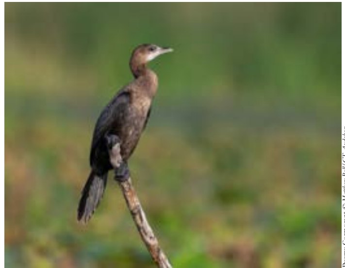
Pygmy Cormorant