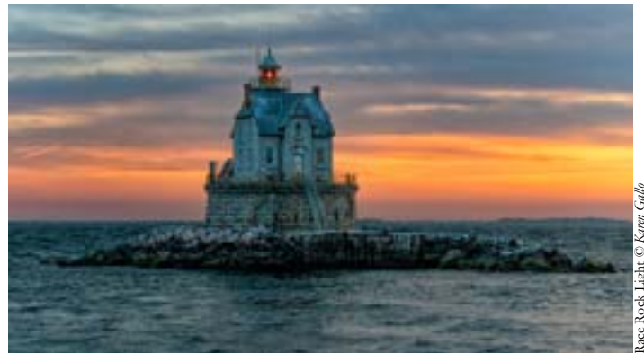
Race Rock Light