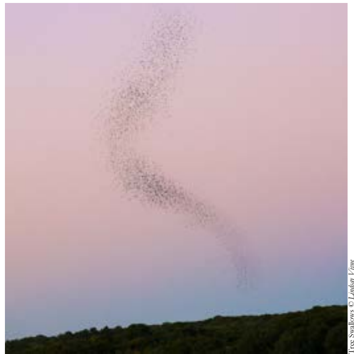
Tree Swallows