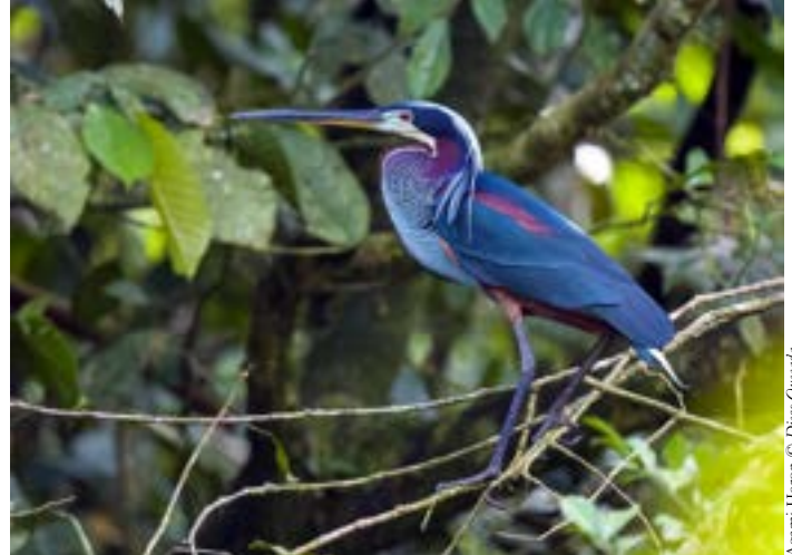
Agami Heron © Diego Quezada