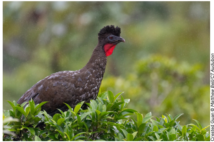
Crested Guan