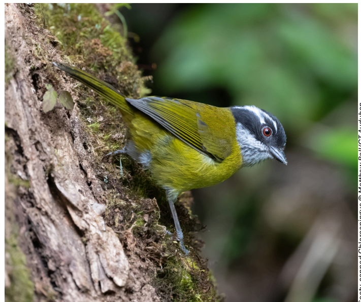
Sooty-capped Chlorospingus