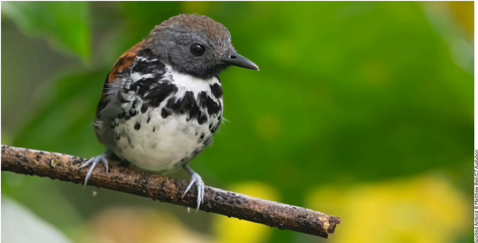
Spotted Antbird