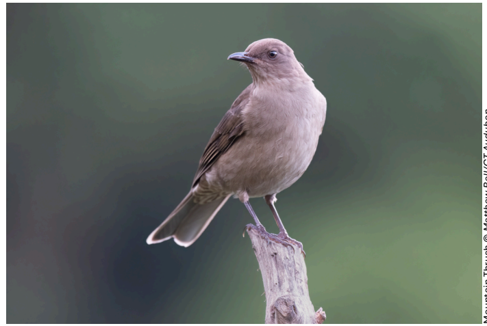
Mountain Thrush