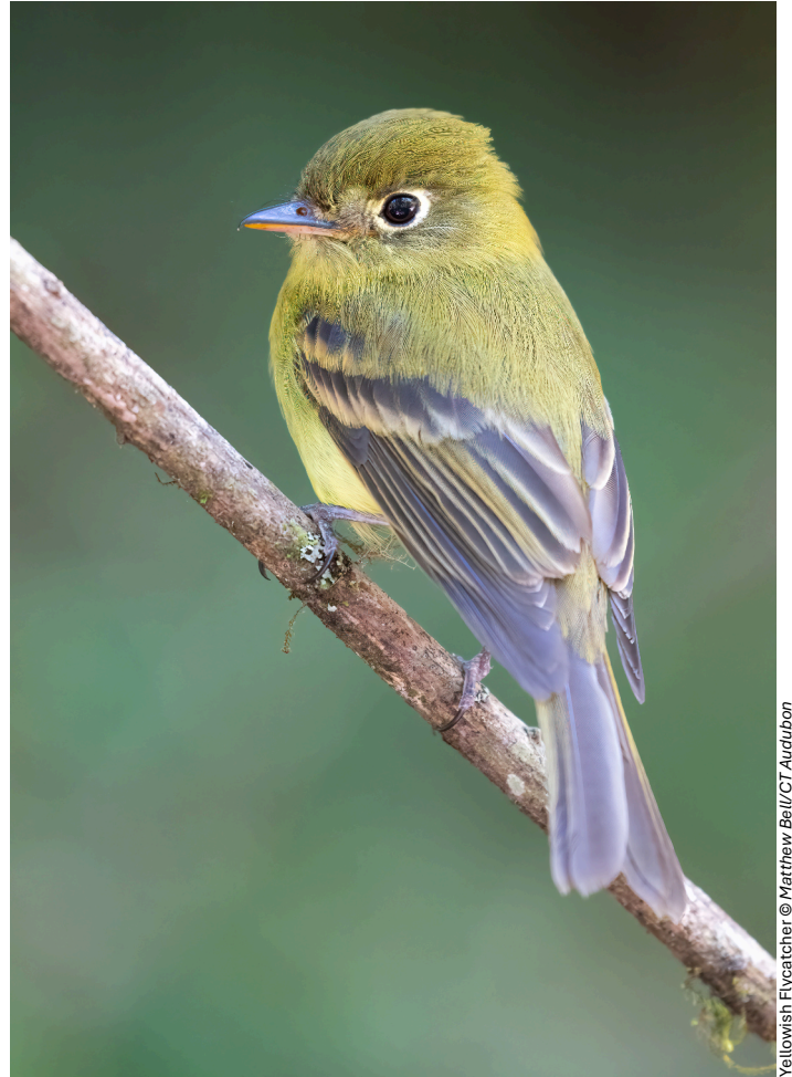
Yellowish Flycatcher