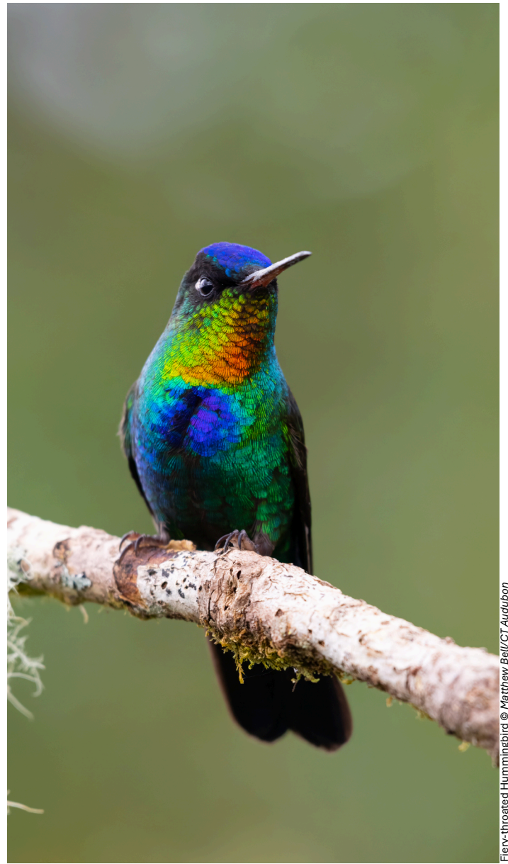
Fiery-throated Hummingbird