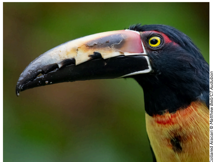
Collared Aracari