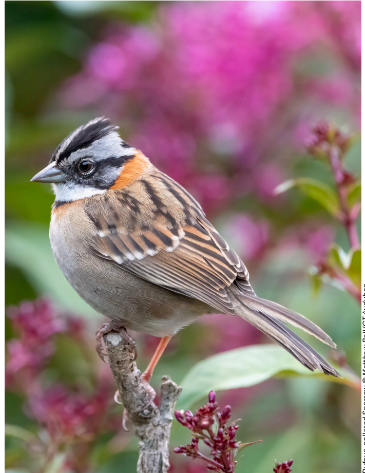
Rufous-collared Sparrow