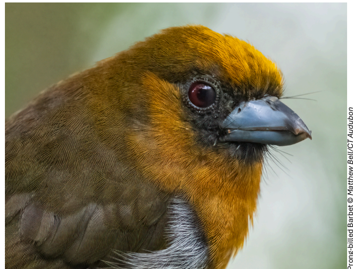
Prong-billed Barbet