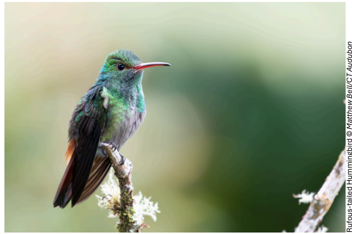
Rufous-tailed Hummingbird