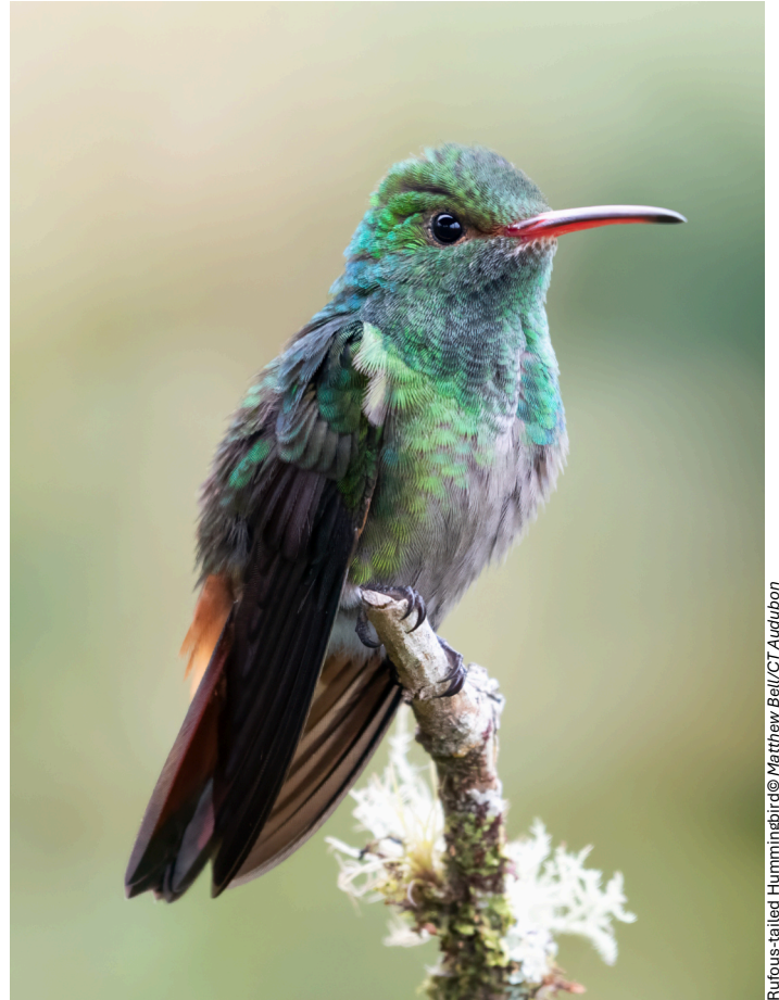
Rufous-tailed Hummingbird