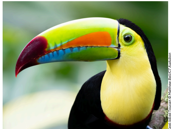
Keel-billed Toucan