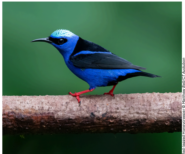
Red-legged Honeycreeper