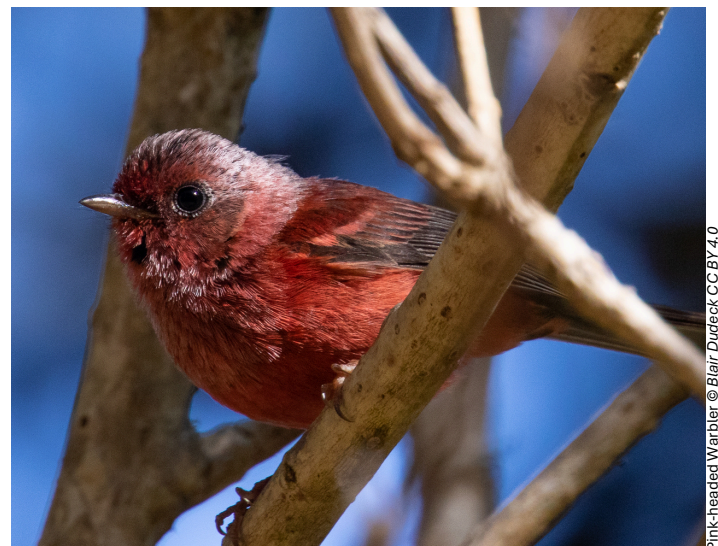
Pink-headed Warbler