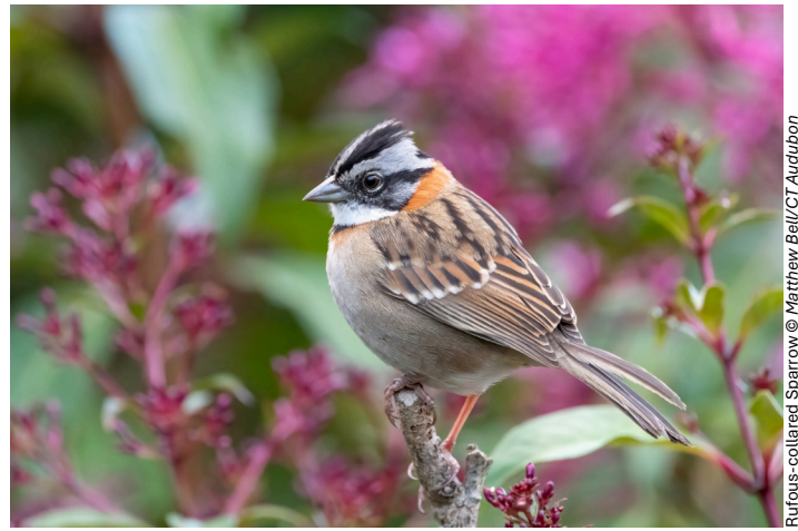
Rufous-collared Sparrow