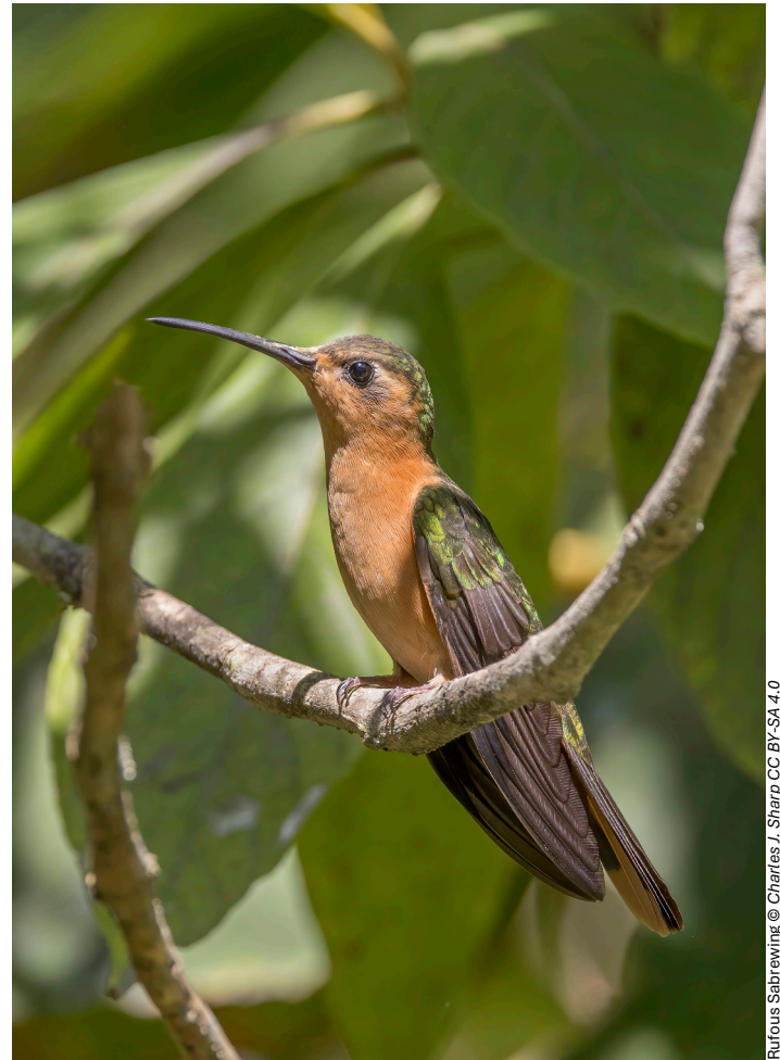
Rufous Sabrewing © Charles J. Sharp CC BY-SA 4.0