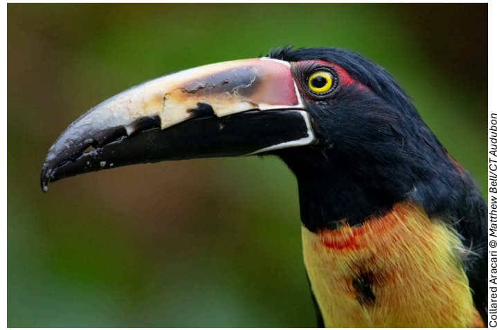
Collared Aracari

Within the grounds of Tikal National Park, among the ancient monuments that stand as remnants of a once-powerful kingdom, a new variety of species awaits us. As we search along the trails, we'll target interesting species including Ocellated Turkey , Orange-breasted Falcon , Yucatan Jay , Black Catbird , Rose-throated Tanager , Great Curassow , White-fronted Amazon , Crested Eagle , Slaty-tailed Trogon , Keel-billed Toucan , Chestnut-