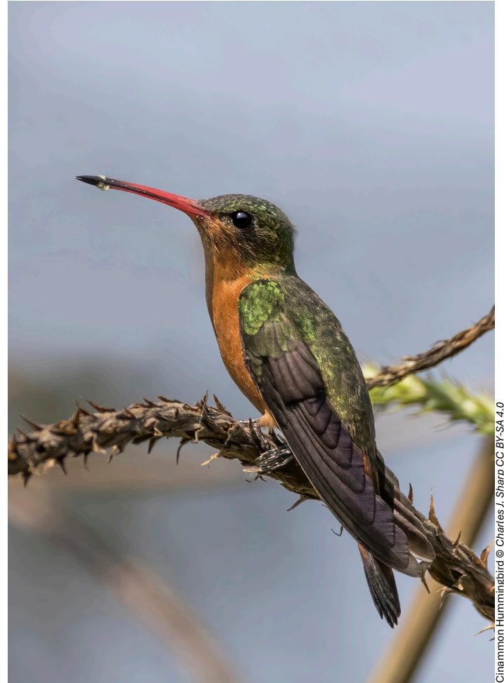
Cinnamon Hummingbird